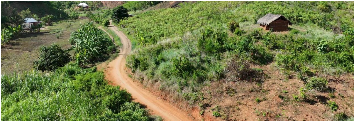
Figure 1: Improvement to farming access track for Mpingu village hamlet.