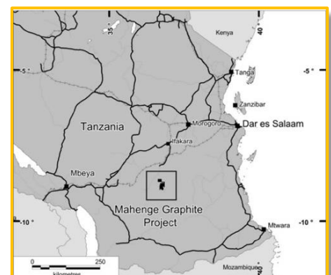
Location of Black Rock's Mahenge Graphite Project in Tanzania

For further information on Black Rock Mining Ltd, please visit www.blackrockmining.com.au